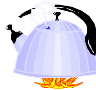
Water vapour or steam is a gas

Use the picture of the glass of pop to answer these questions On the line write S for solid, L for liquid, and G for gas