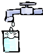
Water is a liquid